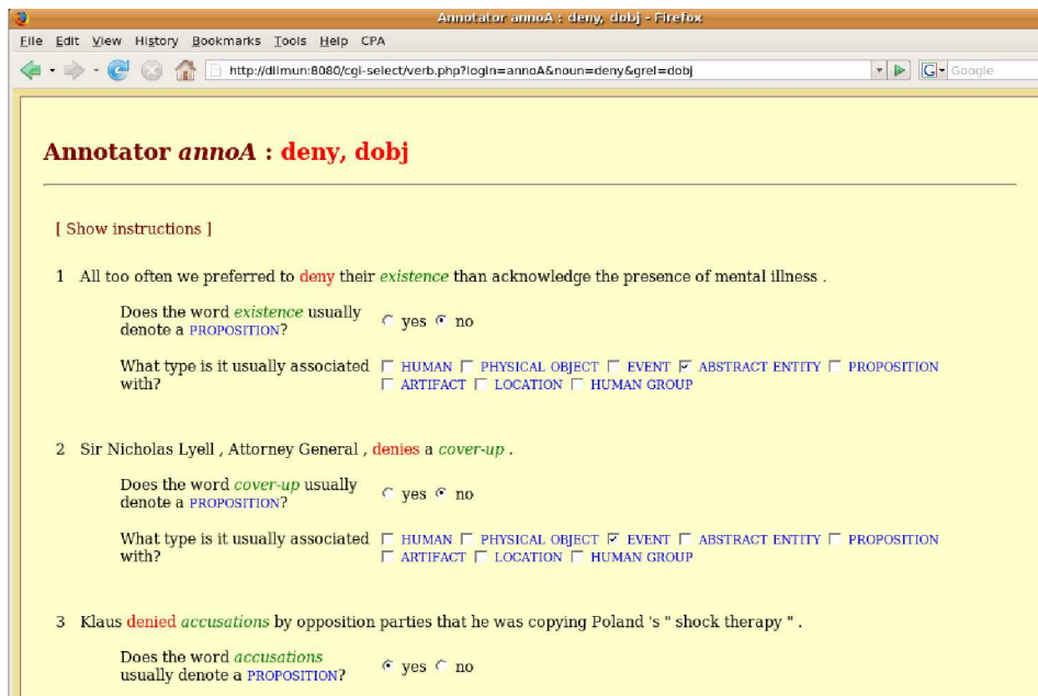
Figure 1: Example of Annotation Interface for GLML Annotation

Due to the complexity of the GLML annotation, we chose to use the task-based annotation architecture. The annotation environment is designed so that the annotator can focus on one facet of the annotation at a time. Thus, in Task 1, the verbs are disambiguated by the annotator in one sub-task, and the annotation of the actual compositional relationship is done in another subtask. Figure 1 shows an example of the interface for the verb-based annotation task .